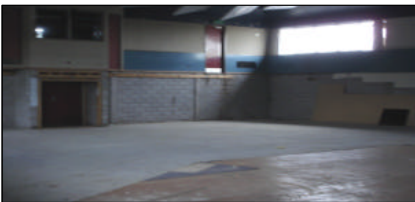
The BGT — before and after - our fabulous new theatre