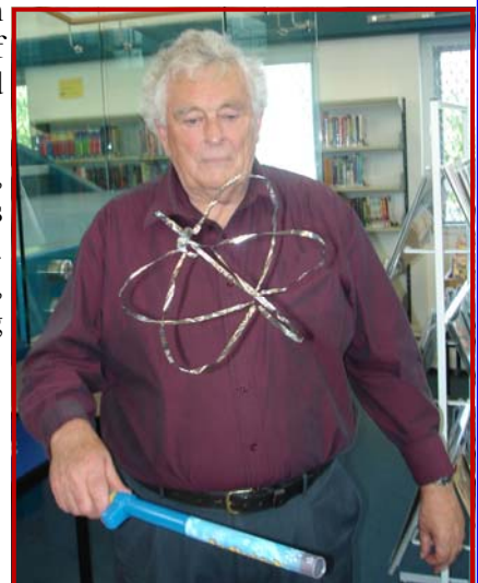
A little scientific magic!

Please keep an eye open if your young person has accidentally come home with a theatrical steel sword and tells you he made or found it. It belongs to the Drama Department of Birkenhead College. Please see that it is returned.