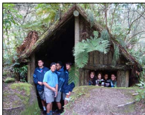
Students at the Buried Village