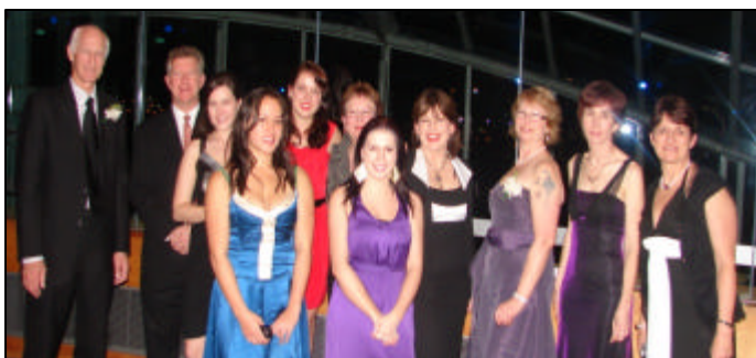
The Principal and some of the staff at the school ball