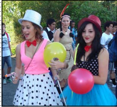
STUDENTS ENJOYING INTERNATIONAL DAY - everybody looked amazing